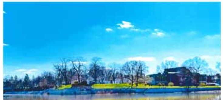
1st place photo in the Conservation category by Colton Wisda, Tinora