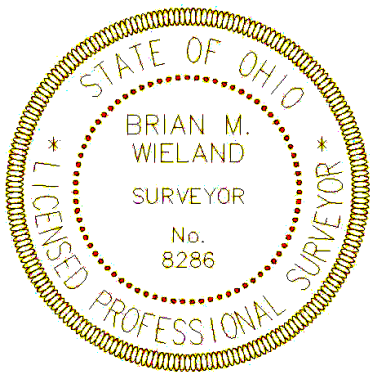
Brian M. Wieland Registered Surveyor No. 8286

Bearings and distances are based on State Plane Coordinates, SPC83, Zone-Ohio North. Monuments described above as "Iron Pin Placed" are 5/8-inch diameter by 30-inch rebar with yellow plastic cap stamped "Wieland-8286."